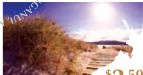
WEATHER EXTREMES HEAT - MATARANGI, 2005