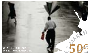
WEATHER EXTREMES WIND - AUCKLAND, 2007