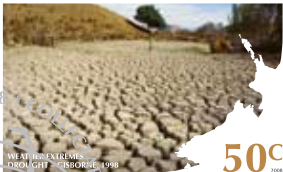
WEATHER EXTREMES DROUGHT - GISBORNE, 1998