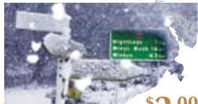
WEATHER EXTREMES SNOW STORM - SOUTHLAND, 2001