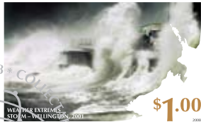
WEATHER EXTREMES STORM - WELLINGTON, 2001