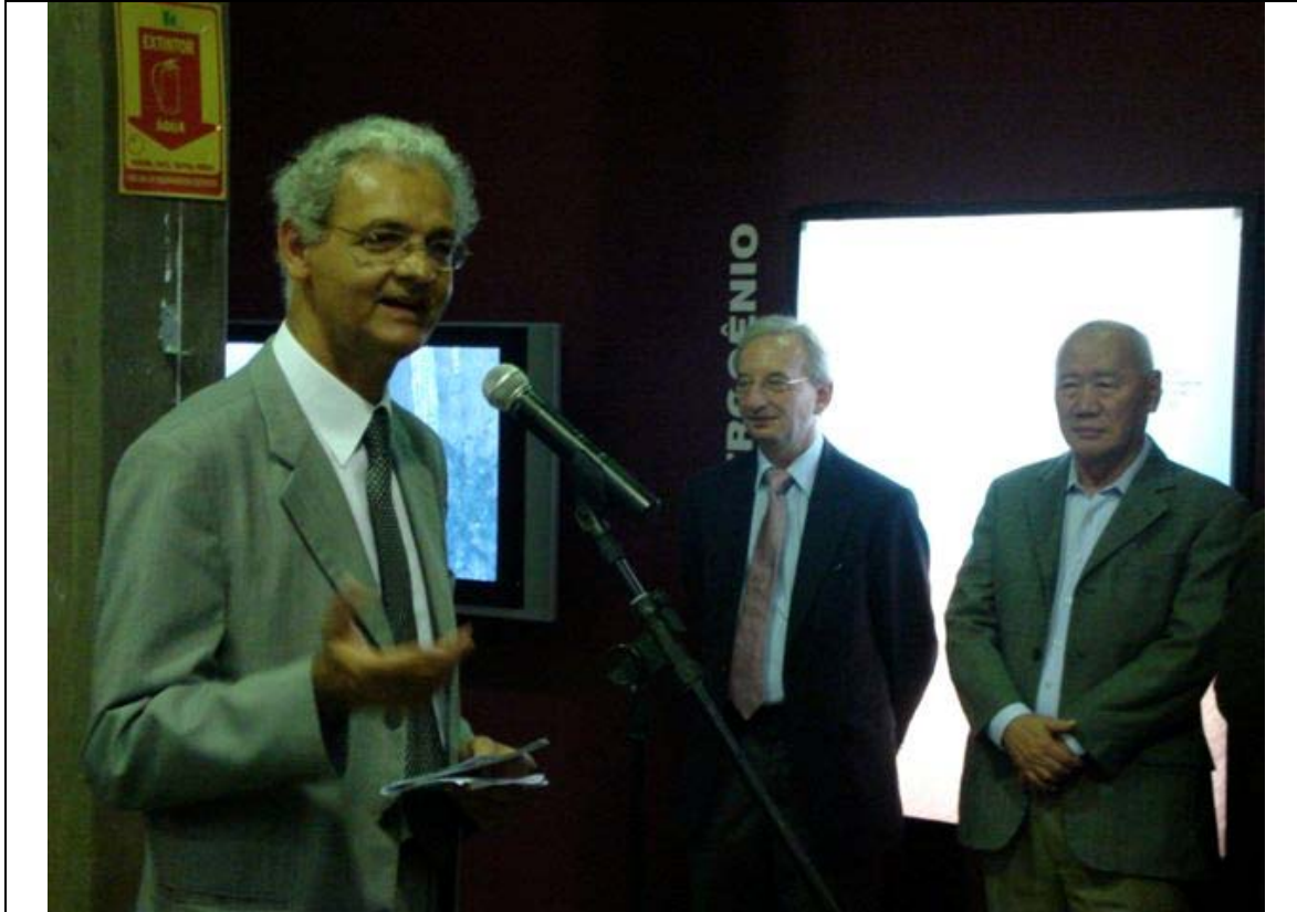
IYPE Brazilian Launch Event Cerimony - Estação Ciência - January 2007