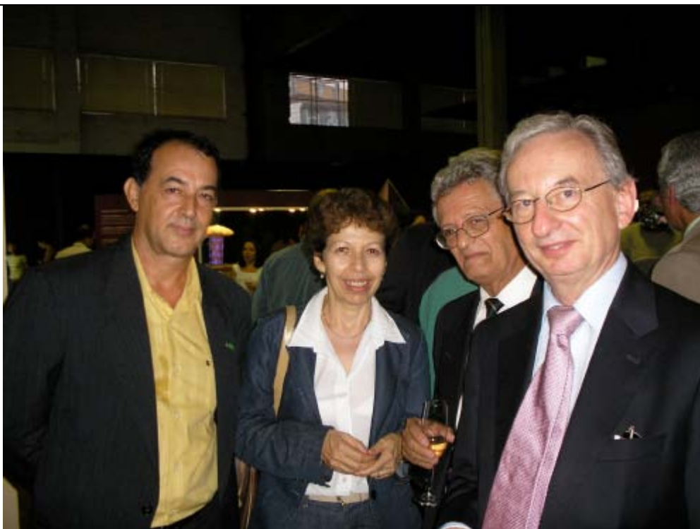
IYPE Brazilian Launch Event Cerimony - Estação Ciência - January 2007