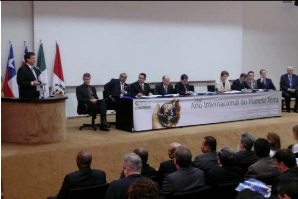
Opening Ceremony with Minister of Science and Technology and other authorities