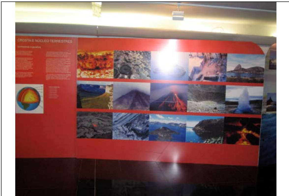
Exhibit : Panel on “Earth Crust and Core”