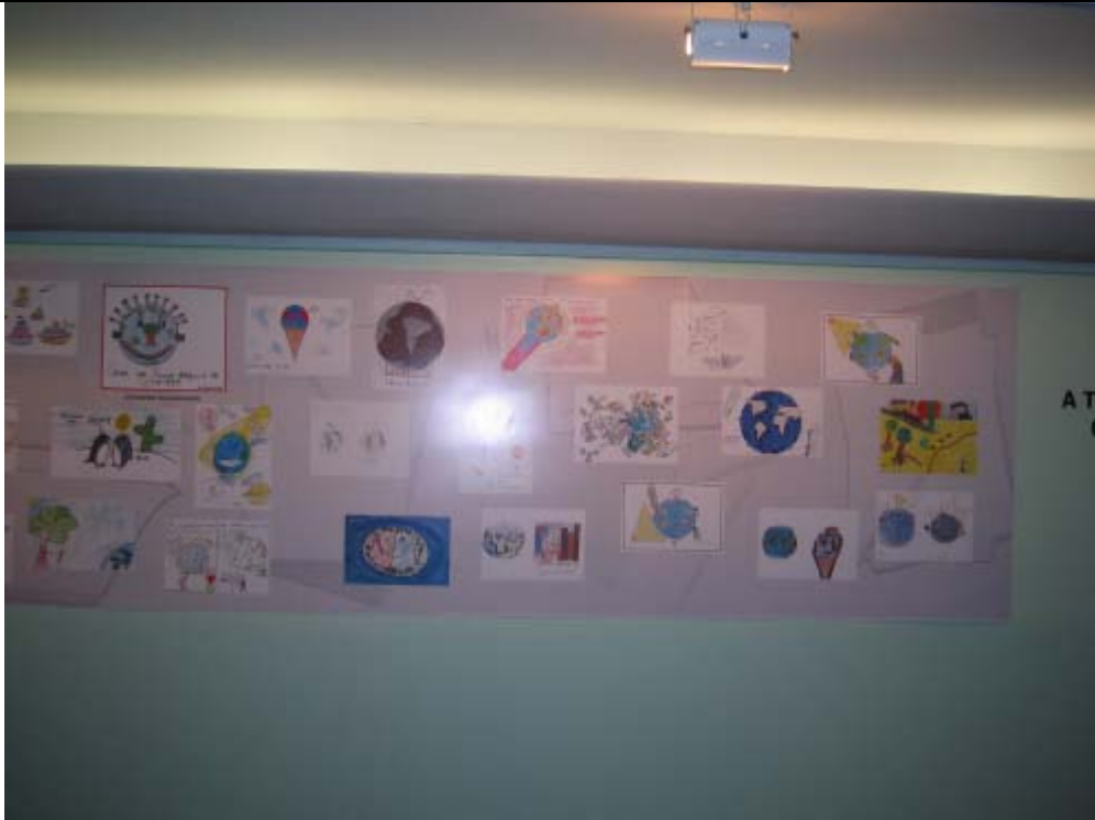
Exhibit: Fundamental and high school students' selected works