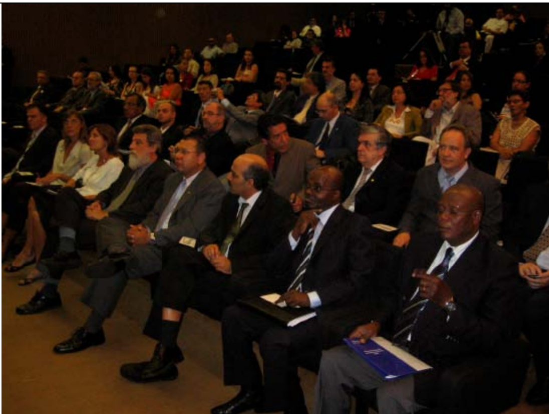
Audience at the Opening Ceremony