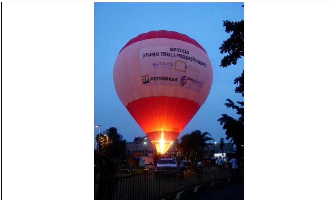
IYPE Brazilian Launch Event Cerimony - Estação Ciência - January 2007