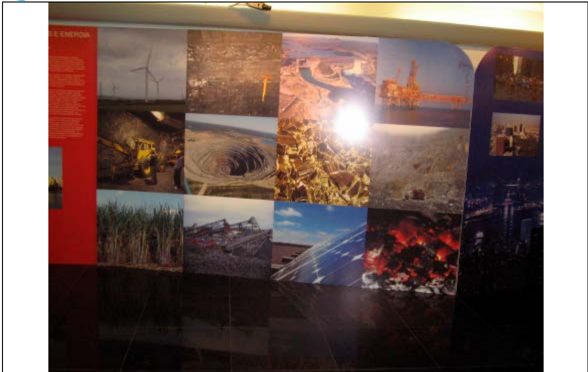
Exhibit: Panel on “Mineral Resources and Energy”