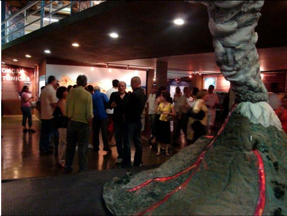
IYPE Brazilian Launch Event Cerimony - Estação Ciência - January 2007