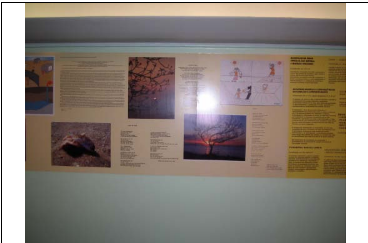
Exhibit: Universitarian students' selected works